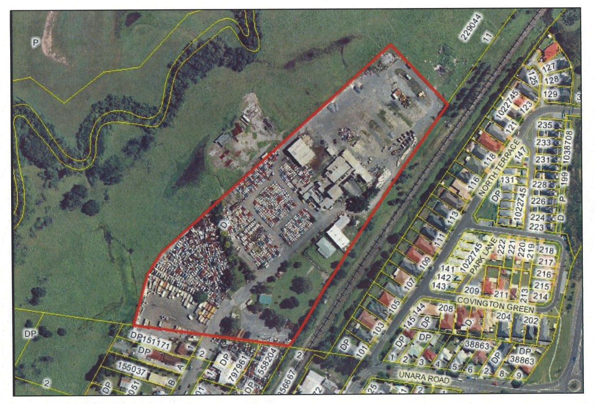
Part Lot 11 DP 229044, Hamilton Street Dapto - proposed to rezone to IN2 Light Industrial