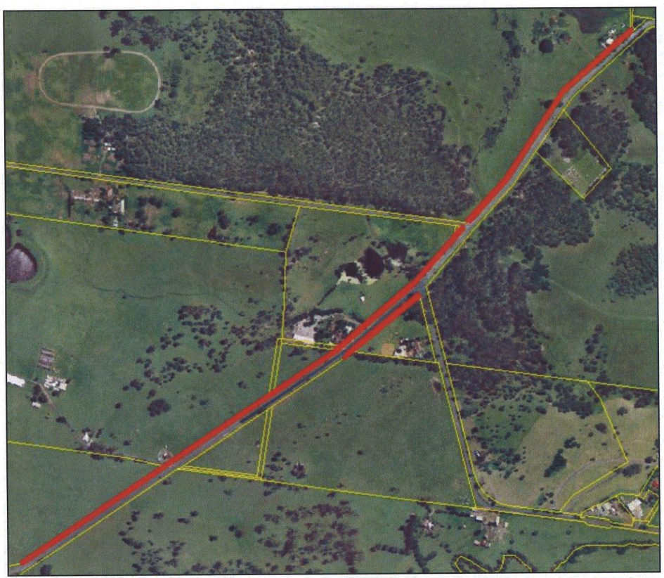
Land along West Dapto Road, east - proposed for future road widening