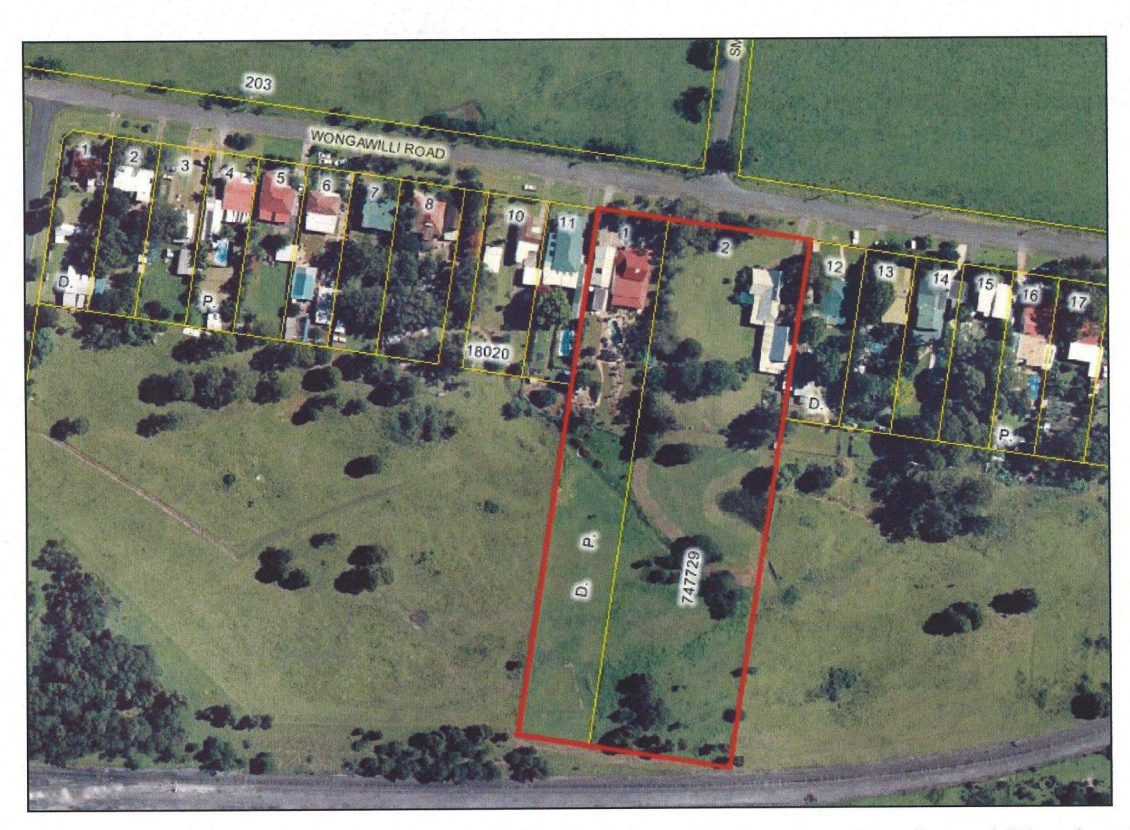
Lots 1 & 2 DP 747729, Wongawilli Road, Wongawilli - proposed to allow additional permitted use of a dwelling house upon the site (subject to development approval.