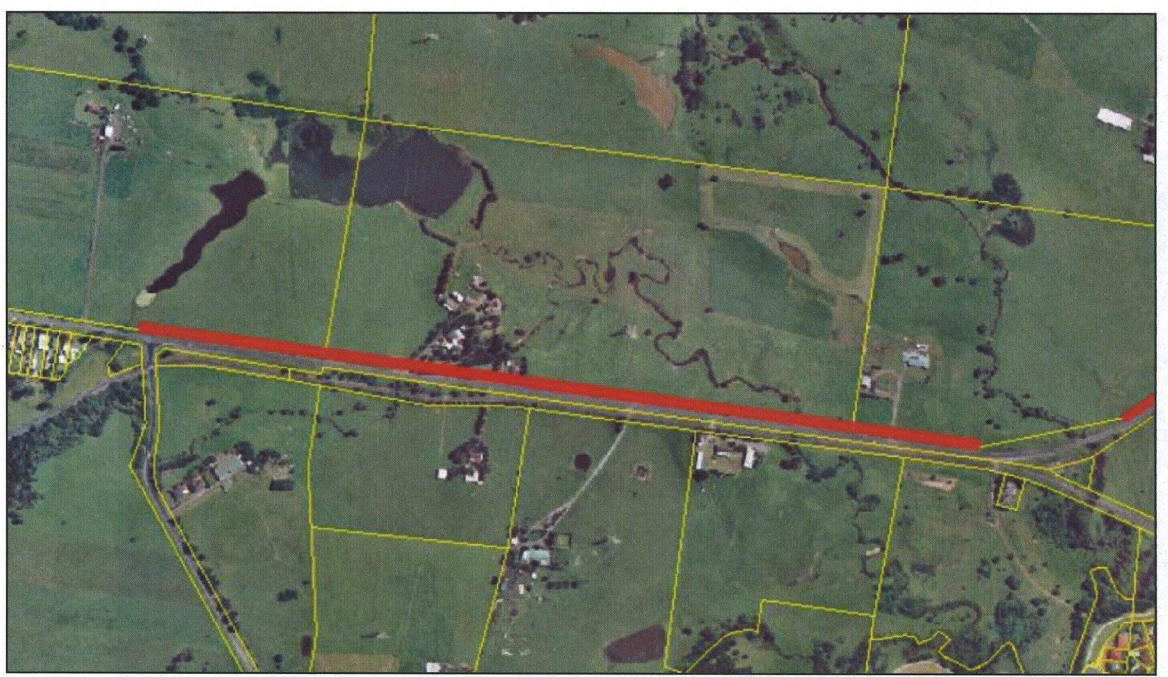
Land along West Dapto Road, west - proposed for future road widening