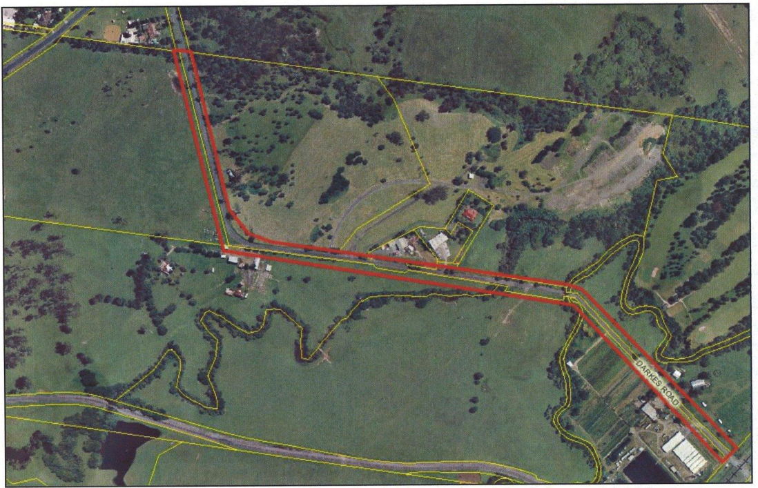
Land along Darkes Road, Kembla Grange - proposed for future road widening